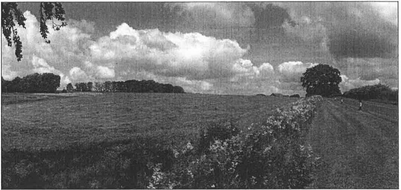
Viewpoint 1: An entrance to Eakshouse of Wistoleo from 8749 Easting Photograph